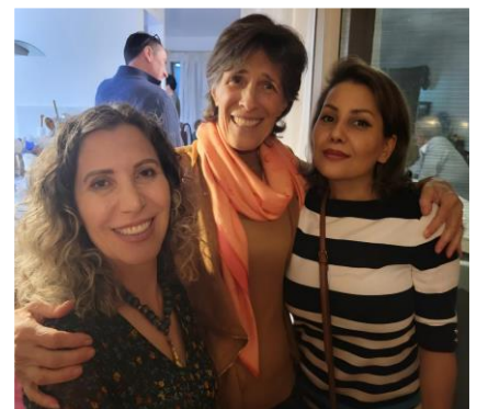
International Scholars House Party