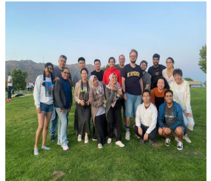
Sunset-watching Party at Sycamore Highlands Park

"Accents are the spice of life." I teach this in Culture Class. Do not be embarrassed about your pronunciation. Everyone has an accent of some type. We need to remind ourselves of this. Yes, sometimes things get "too spicy." Then we speak slower and clearer. And everyone forgets words at times, even native English speakers. Be brave! Keep trying!